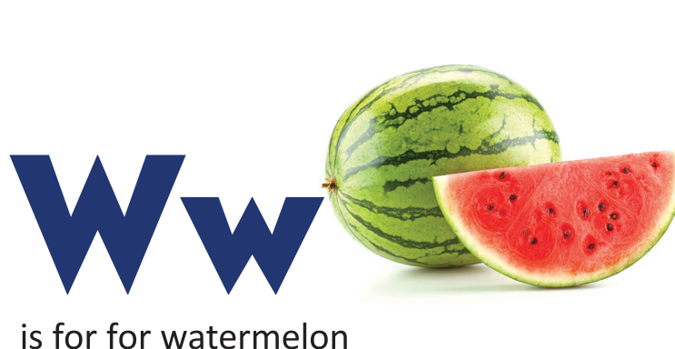
is for for watermelon