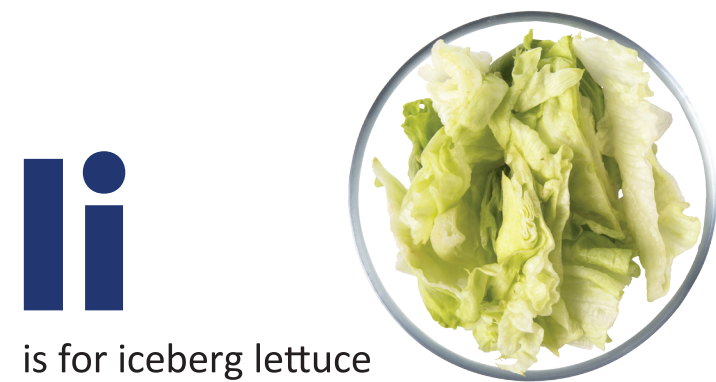
is for iceberg lettuce