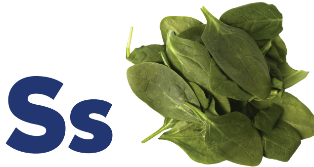
is for spinach