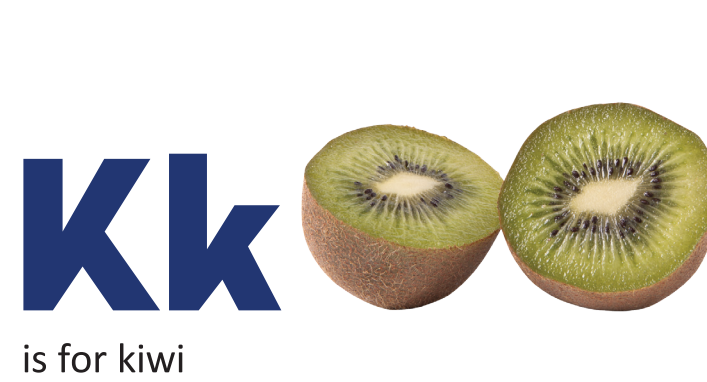
is for kiwi