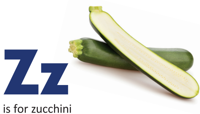
is for zucchini