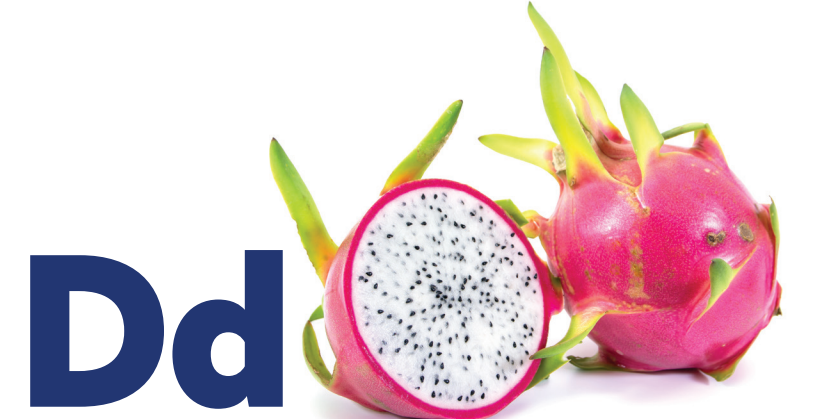
is for dragon fruit