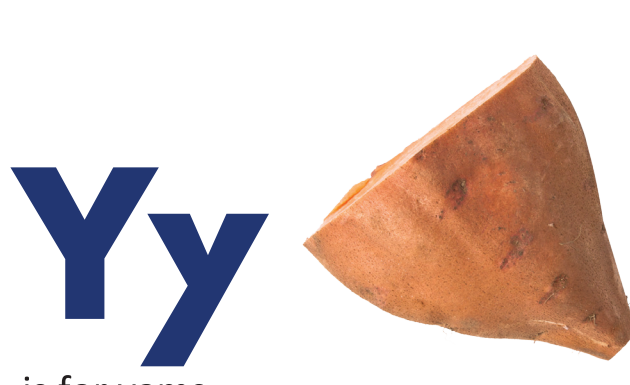
is for yams