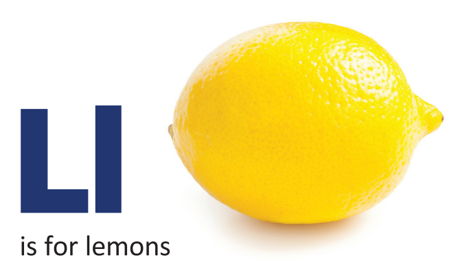
is for lemons