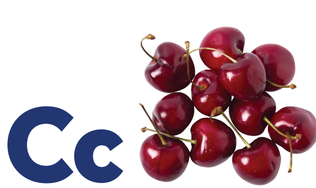
is for cherries