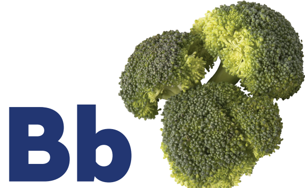
is for broccoli