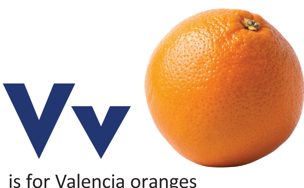
is for Valencia oranges