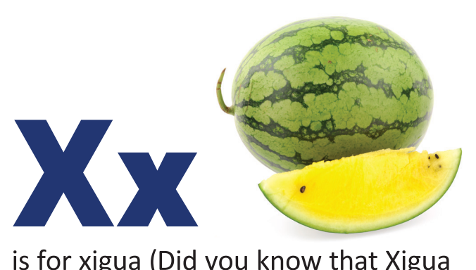
is for xigua (Did you know that Xigua is Chinese for watermelon?)