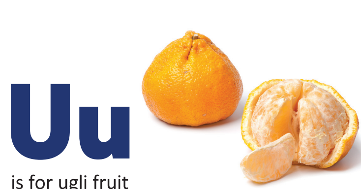
is for ugli fruit