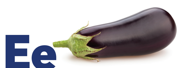
is for eggplant