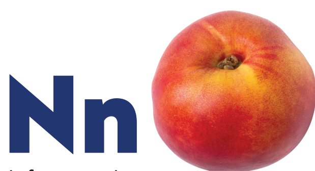
is for nectarines