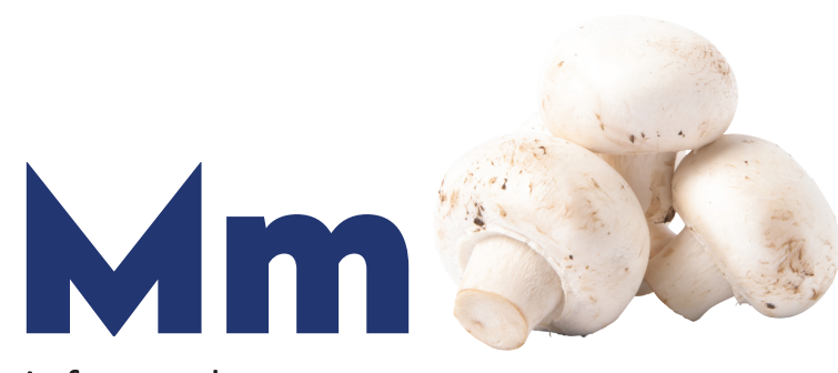
is for mushrooms