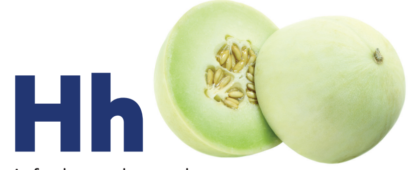
is for honeydew melon