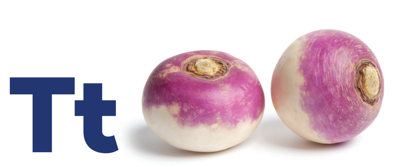
is for turnip