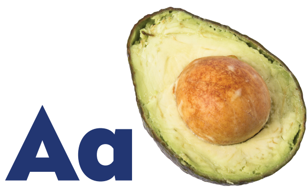
is for avocado