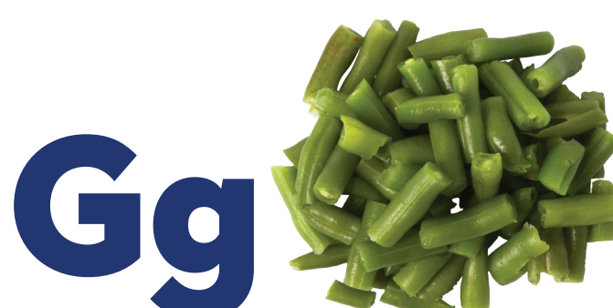
is for green beans