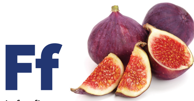
is for figs