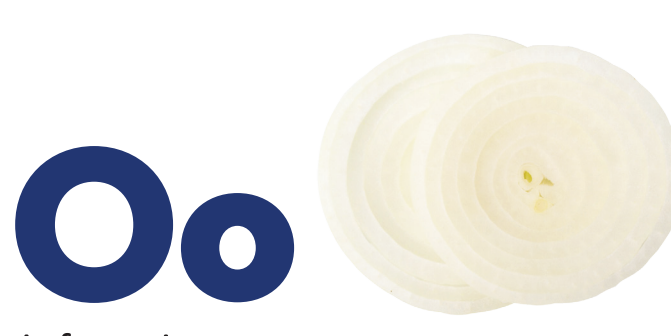
is for onions