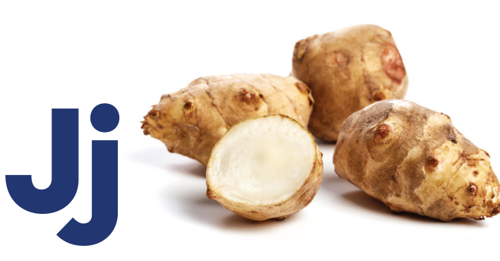
is for Jerusalem artichoke