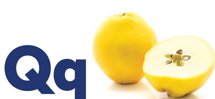
is for quince (like an apple or pear but can't be eaten raw)