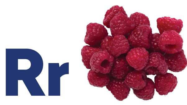
is for raspberries